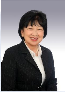
Bcom MonCTA MonCPA